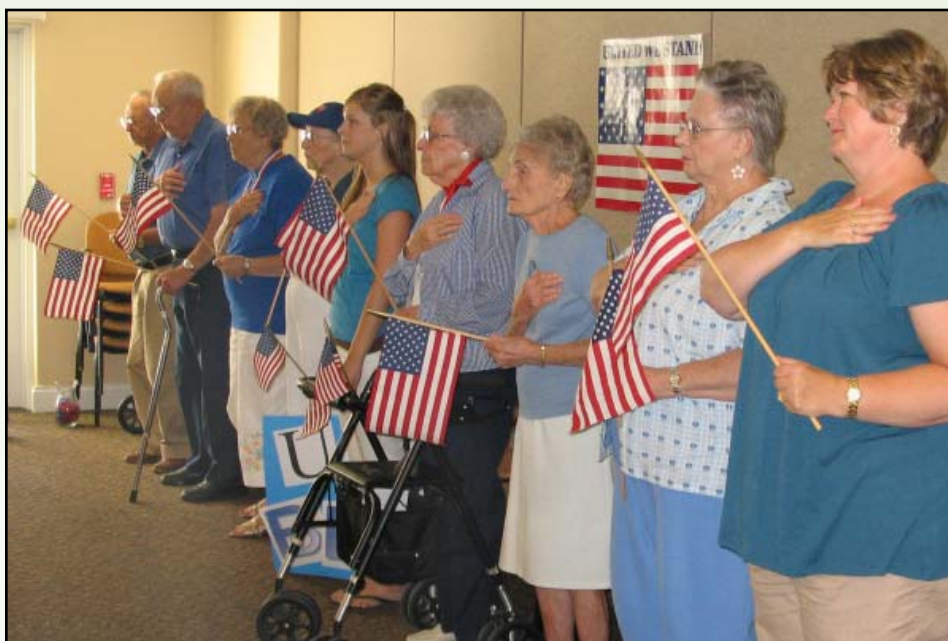
The blue team honors the United States during the singing of the National Anthem.

The Olympic games included noodle hockey, discus, javelin, shot put, and archery relay. Each game used a Waterford variation, which made the games tricky and fun. Noodle hockey was played with foam water noodles while players remained in a seated position. The discus throwers used foam plates, and the javelin throwers used straws as their equipment. The shot put was especially tricky, as competitors used balloons filled with several beans as their throwing equipment. The archery relay consisted of three teammates squirting a (cont.)