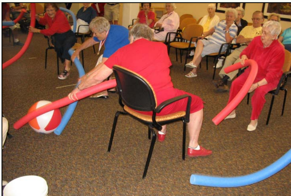
The teams compete in a lively hockey game with foam noodles as hockey sticks.