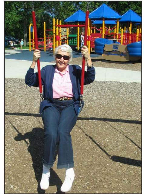
It's called the Universal Playground ... must mean it's for all ages. Residents took in a bright-blue sky day at Lindenwood Park and enjoyed a picnic.